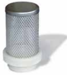
Inox suction filter 1"