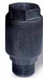
Techno-polymer check valve