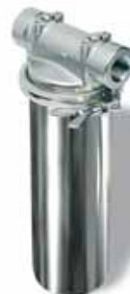
Filters inox aisi 316 10"