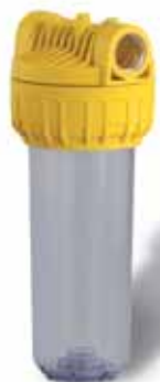
Filters 5" - 7" - 10"