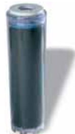
Active carbon filtering cartridges

Code: X - FIL5 5" X - FIL7 7" X - FIL10 9"3/4