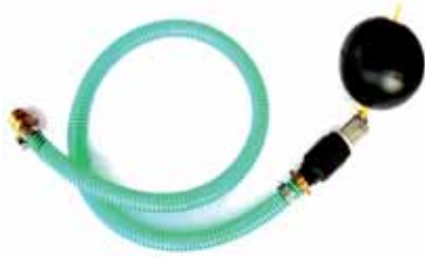
Suction kit with floating ball and check valve