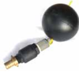
Floating ball and check valve