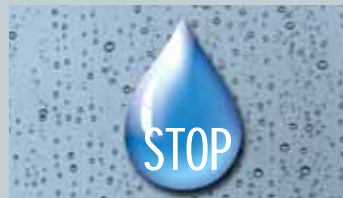
DRY RUNNING PROTECTION