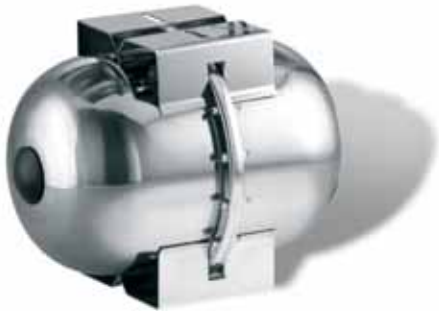
Stainless steel 24 lt tank

Code: Electric cable 01GEA992C 2 mt 01GEA993C 3 mt 01GEA995C 5 mt 01GEA910C 10 mt