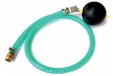
Suction kit with floating ball