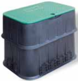
Underground well for booster slot