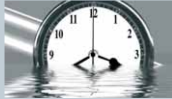
AS ANTIBLOCKING SYSTEM 72 H