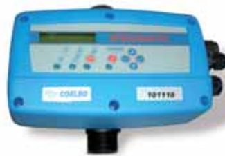
Single-phase / three-phase inverter