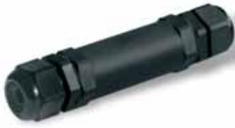
Electric connections IP 68