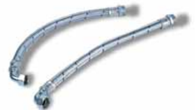
Flexible pipe 1"