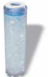
Polyphosphate filtering cartridges

Code: X - CA5 5" X - CA7 7" X - CA10 9"3/4