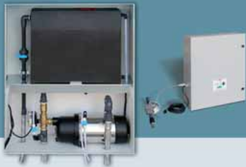
Rain water control system with pump and probes for level control.