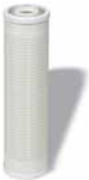
Nylon filtering cartridges

Code: X - NY5 5" X - NY7 7" X - NY10 9"3/4