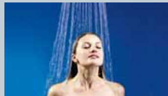
FAST ON-OFF SWITCHING