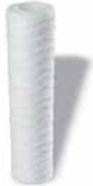
Wound wire filtering cartridges

Code: X - NY5 5" X - NY7 7" X - NY10 9"3/4